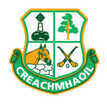
<u>Craughwell – Co. Galway</u>