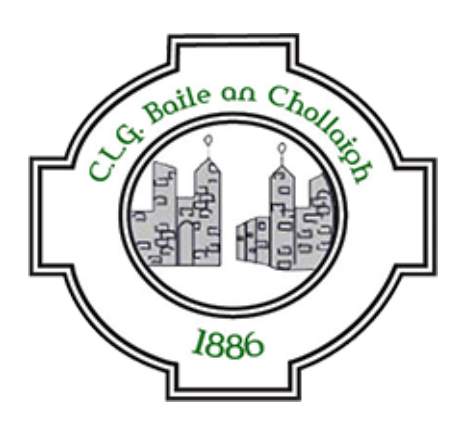
Ballincollig GAA - Co. Cork