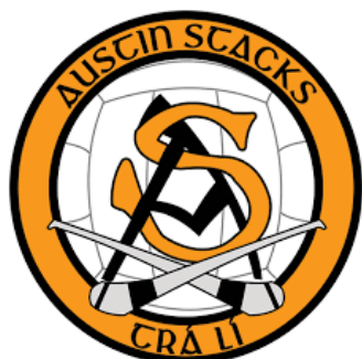
Austin Stacks – Kerry