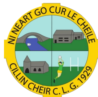
Killinkere – Cavan