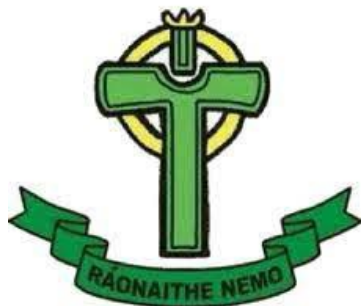
Nemo Rangers – Cork