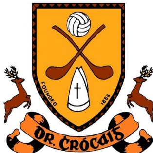
Dr. Crokes – Kerry